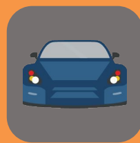
Lifestyle way beyond means