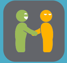
Inappropriate/un-disclosed relationship with vendor