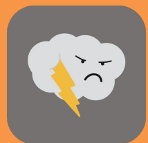
Change in normal demeanor; frequently anxious or upset

Seeing these red flags? Here's what to do: