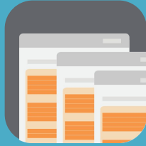
Unusual number of invoices