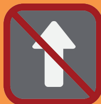
Uninterested in promotion