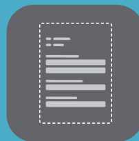
Lack of supporting documents