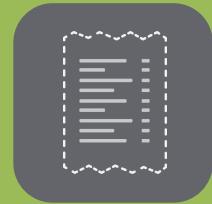
Frequently missing receipts