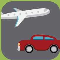
Travel unusually heavy for role