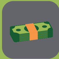
Frequent cash expenses