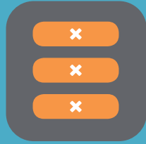
Frequent canceled transactions