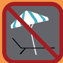
Refuses to take vacations