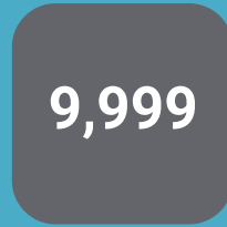
Invoices just under approval threshold