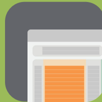
Vague expense descriptions