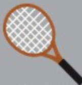
COUNTRY CLUB MEMBERSHIPS