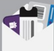
CASH EQUIVALENTS (Gift Cards/Tickets)